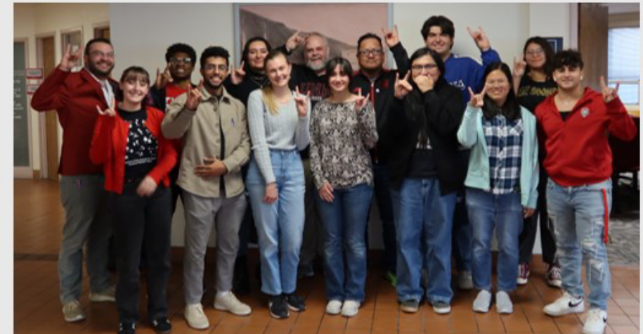
Greenberg Research Group Fall 2024